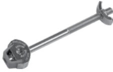
ZIPBOLT™ UT MINI (10.800)