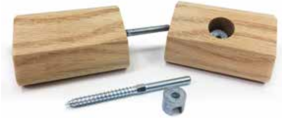
UT MICRO RAIL BOLT 2 PACK W/ DRIVER (16.610)

A smaller version of the original, perfect for small round and small profile rails