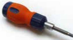
ZIPBOLT RATCHET DRIVER (40.300)