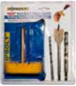
ZIPBOLT UT RAIL BOLT DRILL GUIDE (40.260)

Optional tool for even quicker installation. Not for use with ZIPBOLT Super UT