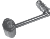
ZIPBOLT™ UT MINI HALF MITER (11.720)