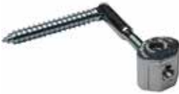
ZIPBOLT ANGLED RAIL BOLT (11.550)