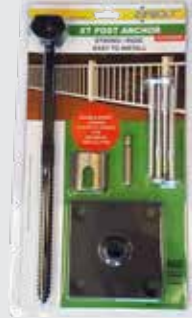
EXTERIOR XT POST ANCHOR (17.800)