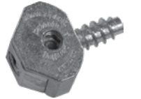
ZIPBOLT™ UT MINI KD (12.600)