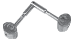
ZIPBOLT™ UT MAXI MITER (11.600)