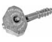
ZIPBOLT™ UT MINI KD (12.601)