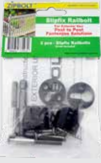
EXTERIOR SLIPFIX RAIL BOLT 2 PACK W/ DRIVER (17.150)