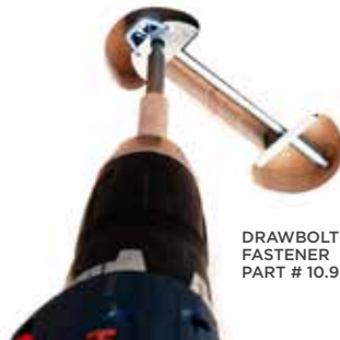
DRAWBOLT COUNTER TOP FASTENER PART # 10.900