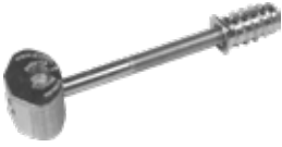
ZIPBOLT™ UT MIDI (13.520)