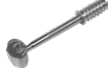
ZIPBOLT™ UT MAXI (13.500)