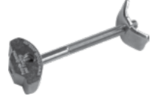
ZIPBOLT™ UT (10.500)