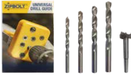
ZIPBOLT UNIVERSAL DRILL GUIDE (40.280)

The universal drill guide works with several fasteners listed