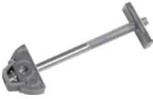
ZIPBOLT™ DRAWBOLT (10.900)