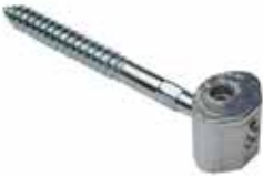
ZIPBOLT UT RAIL BOLT (13.600)